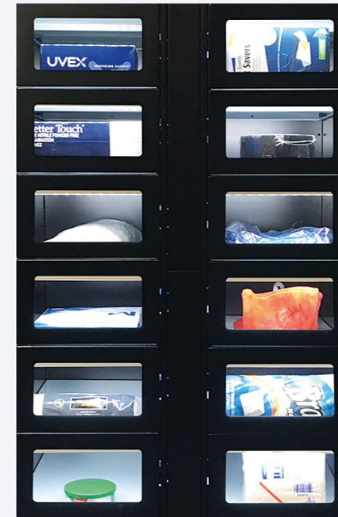
Middle 12 Storage Compartments 336.55mm(W) x 151.38mm(H)