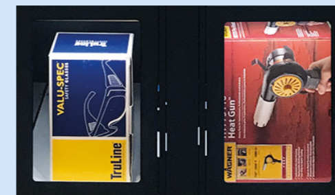
Bottom 2 Storage Compartments 336.55mm(W) x 392.43mm(H)