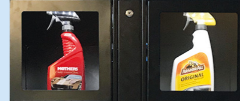
Top 2 Storage Compartments 336.55mm(W) x 292mm(H)